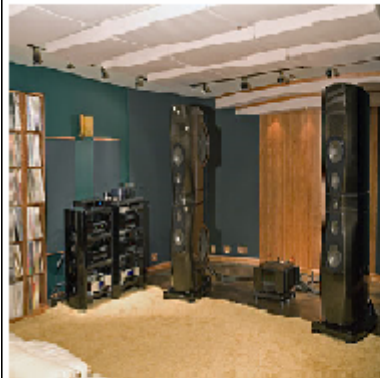
audio zone 1