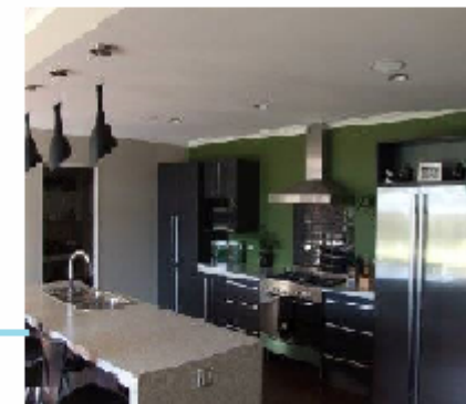
audio zone N