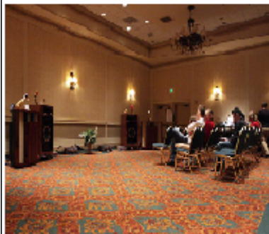
audio zone 2