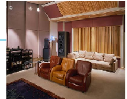
audio zone 3